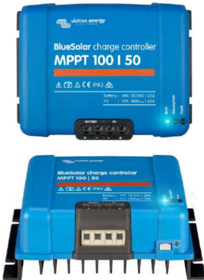
BlueSolar Charge Controller MPPT 100/50